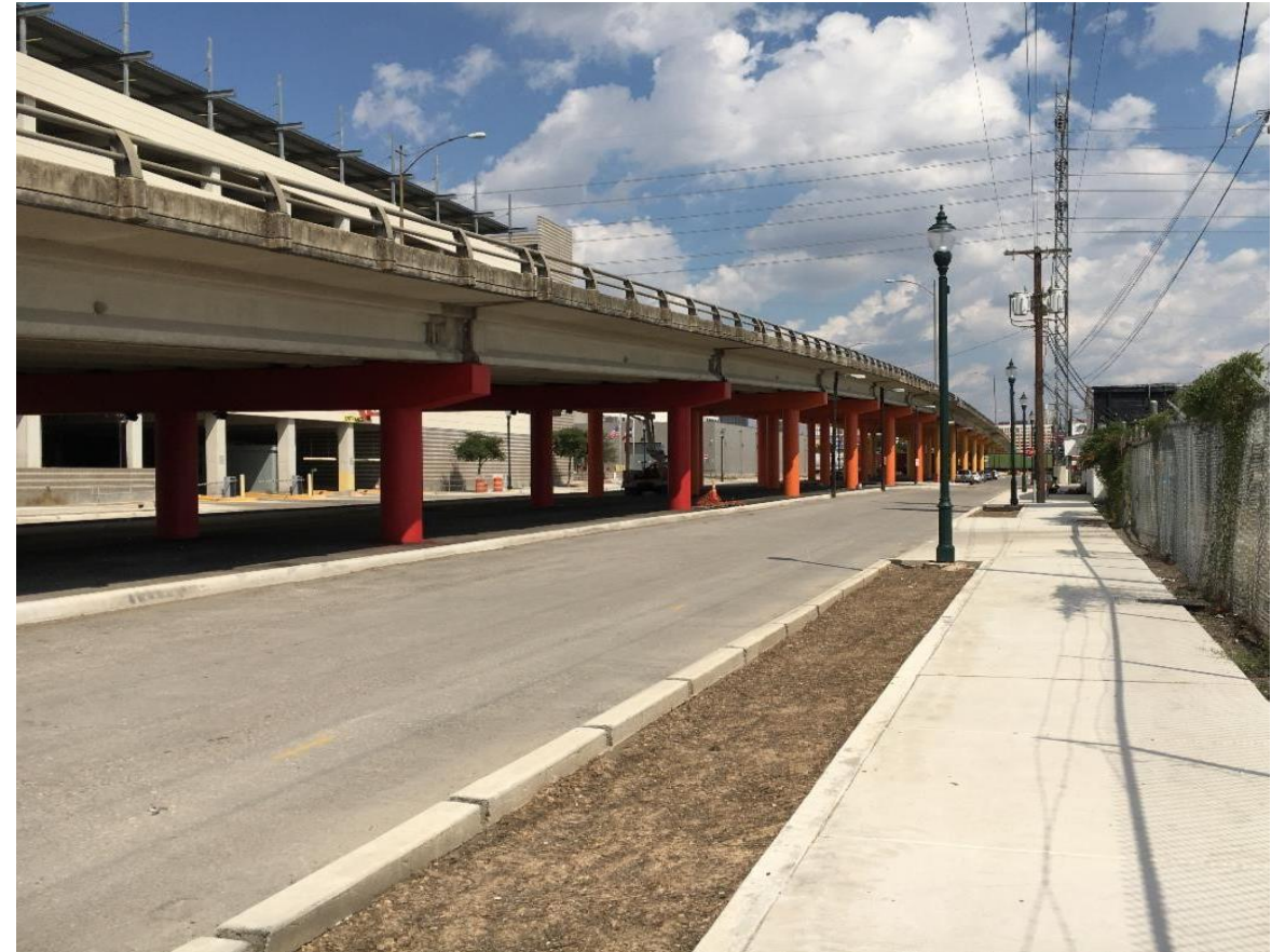
West Commerce Bridge new bio-swale landscaping planter section, sidewalk, streetlights and roadway.