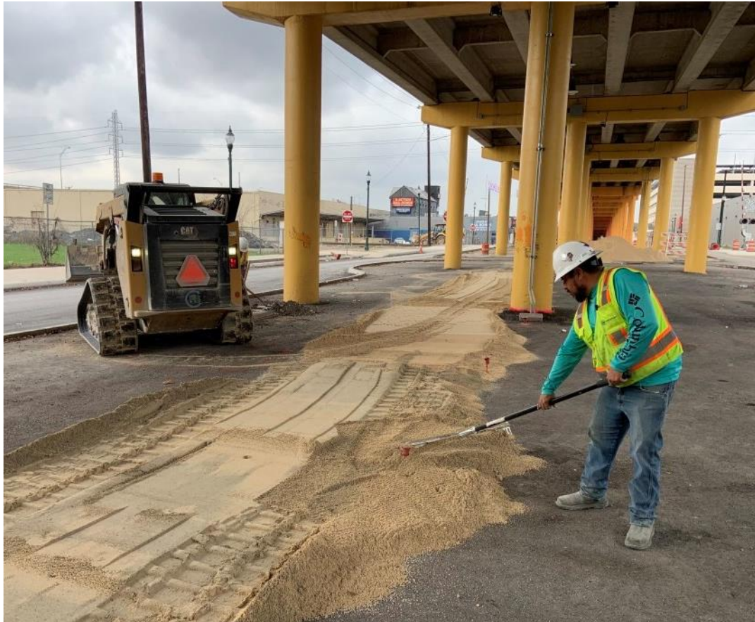
West Commerce Bridge prep-work for paver installation.