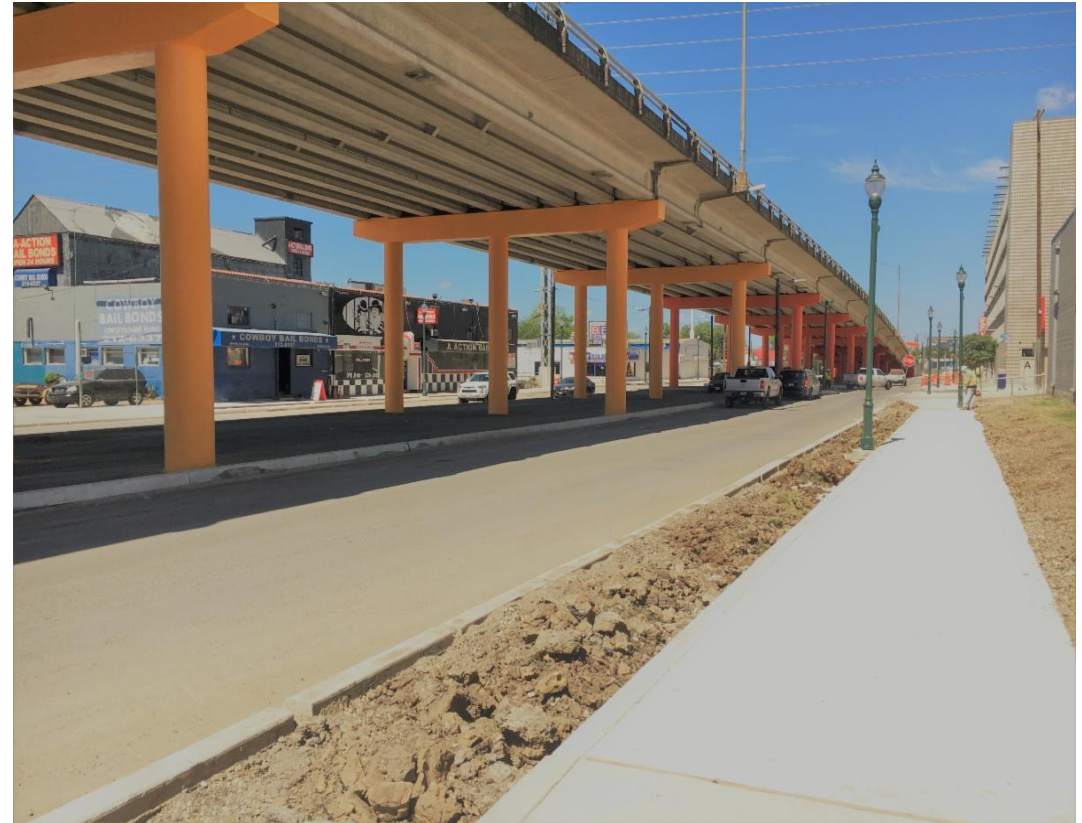
West Commerce Bridge column painting, new curb, sidewalk, and streetlights.